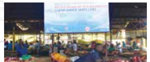
City and stakeholders installed Health and hygiene display boards as seen in the image to further continue reinforce hygiene messages.