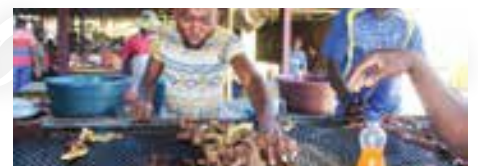
"Kapana" Traders at Oshetu Market amongst the recipient food traders who benefited from the Health and Hygiene messages shared.